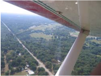
Demo flight in a Bearhawk

Please advise your chapter of the upcoming events we're planning at Chapter 1310, Skylark Airpark, East Windsor, CT