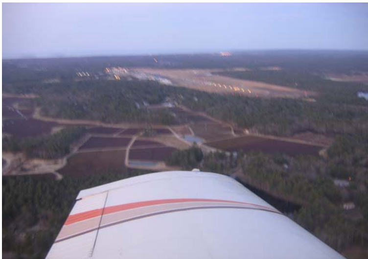
Can you tell me where I'm about to land?

Already a member of 1363? Have YOU invited anyone to come with you to this months meeting? Why not share the fun?