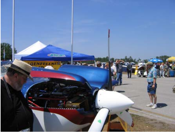
Sun-n- Fun 2006